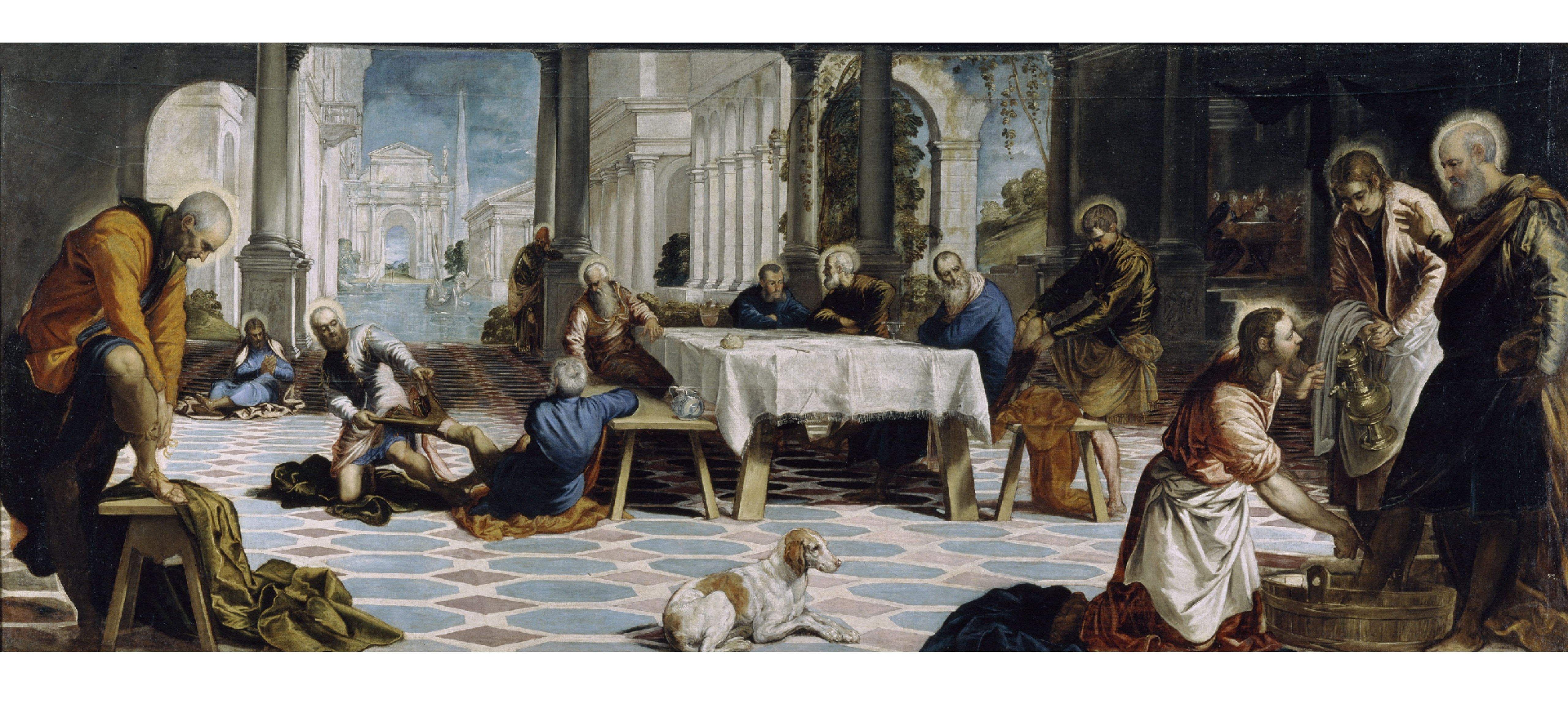
La lavanda dei piedi (The washing of the feet) - oil on canvas Tintoretto, 16th century Venetian painter